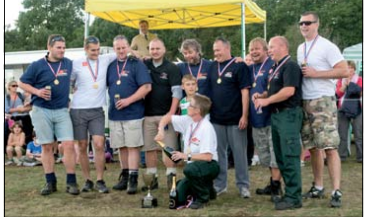
The winners - The Trauma Team - from the local ambulance service