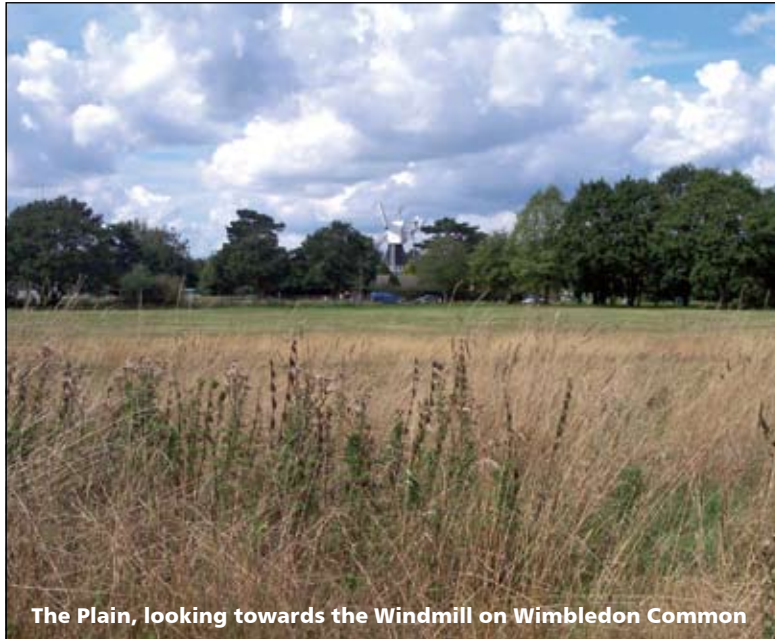
The Plain, looking towards the Windmill on Wimbledon Common

While the return of Skylarks to the Plain would undoubtedly be seen as a major conservation success for our local area, the Conservators remain committed to providing the best surroundings that can be enjoyed by wildlife and visitors alike.