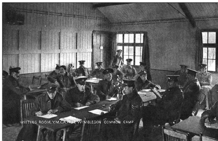
WRITING ROOM, YMCA HALL, WIMBLEDON COMMON CAMP

were tended by Italian prisoners of war who were housed in a camp near Southside. During air raids many bombs fell on the Common and required excavation from a considerable depth. Several flying bombs (V1s) fell on the Common, including one on the edge of Rushmere Pond and another at Warren Farm. The only German aircraft to land was a bomber that crashed onto the Royal Wimbledon Golf Course, scattering burning wreckage over the nearby area of Wimbledon Common.