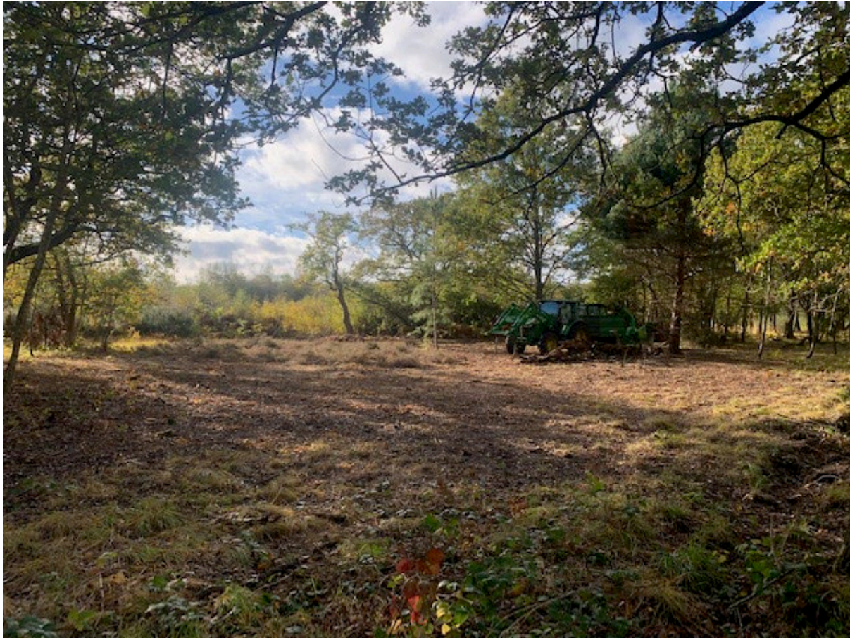
Heathland close to the junction of Ladies Mile and Inner Park Ride. (November 2023)

To help with the removal of smaller though equally invasive scrub, over the past two months, there have been seven volunteer groups on the Commons. These groups have cut back invasive scrub in the following areas: