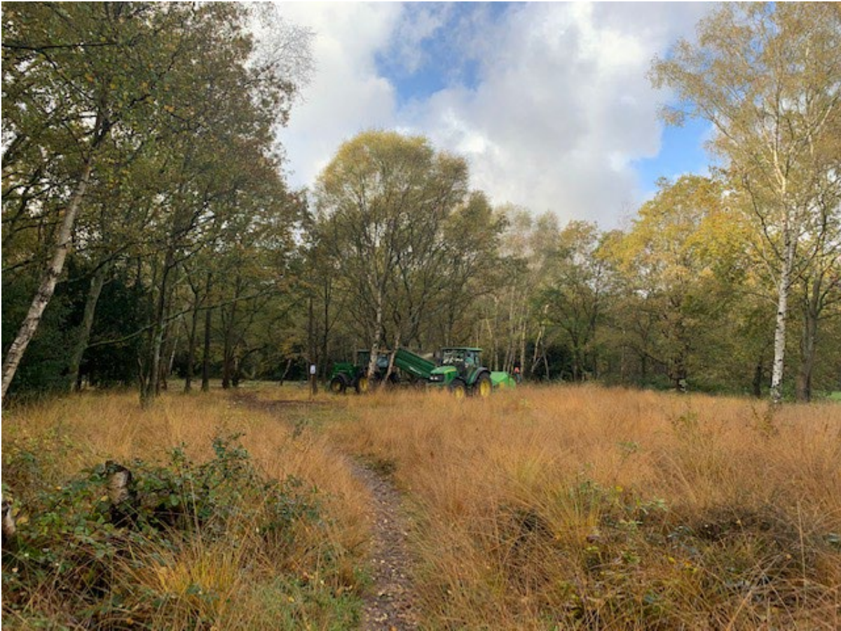
The Commons' Maintenance Team carrying out heathland restoration near Tibbet's Meadow during November 2023.

In addition to the heathland work that has been carried out near Tibbet's Meadow, another area of heathland where invasive trees have recently been cut back is located close to the junction of Ladies Mile and Inner Park Ride. While the work in this area only covered a relatively small area of heathland, there is a good coverage of heather remaining on this site which should benefit from increased levels of light and the reduction of invasive vegetation.