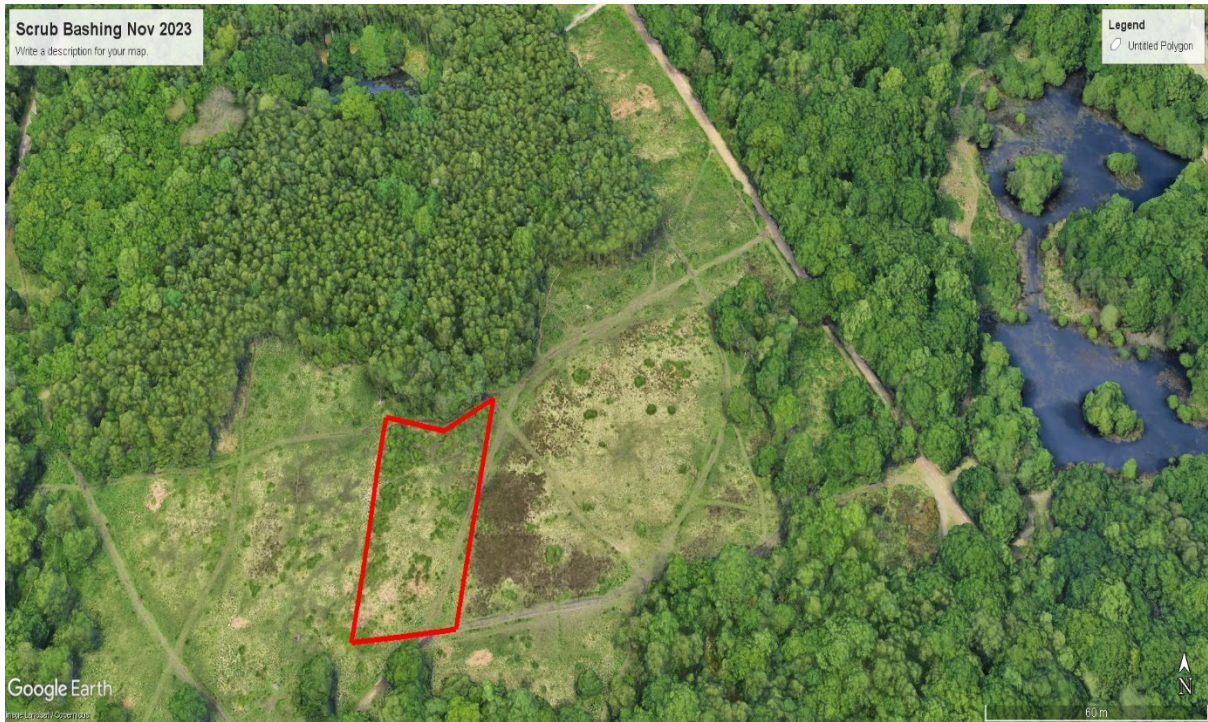
Scrub bashing, Wimbledon Common, autumn 2023 (above)