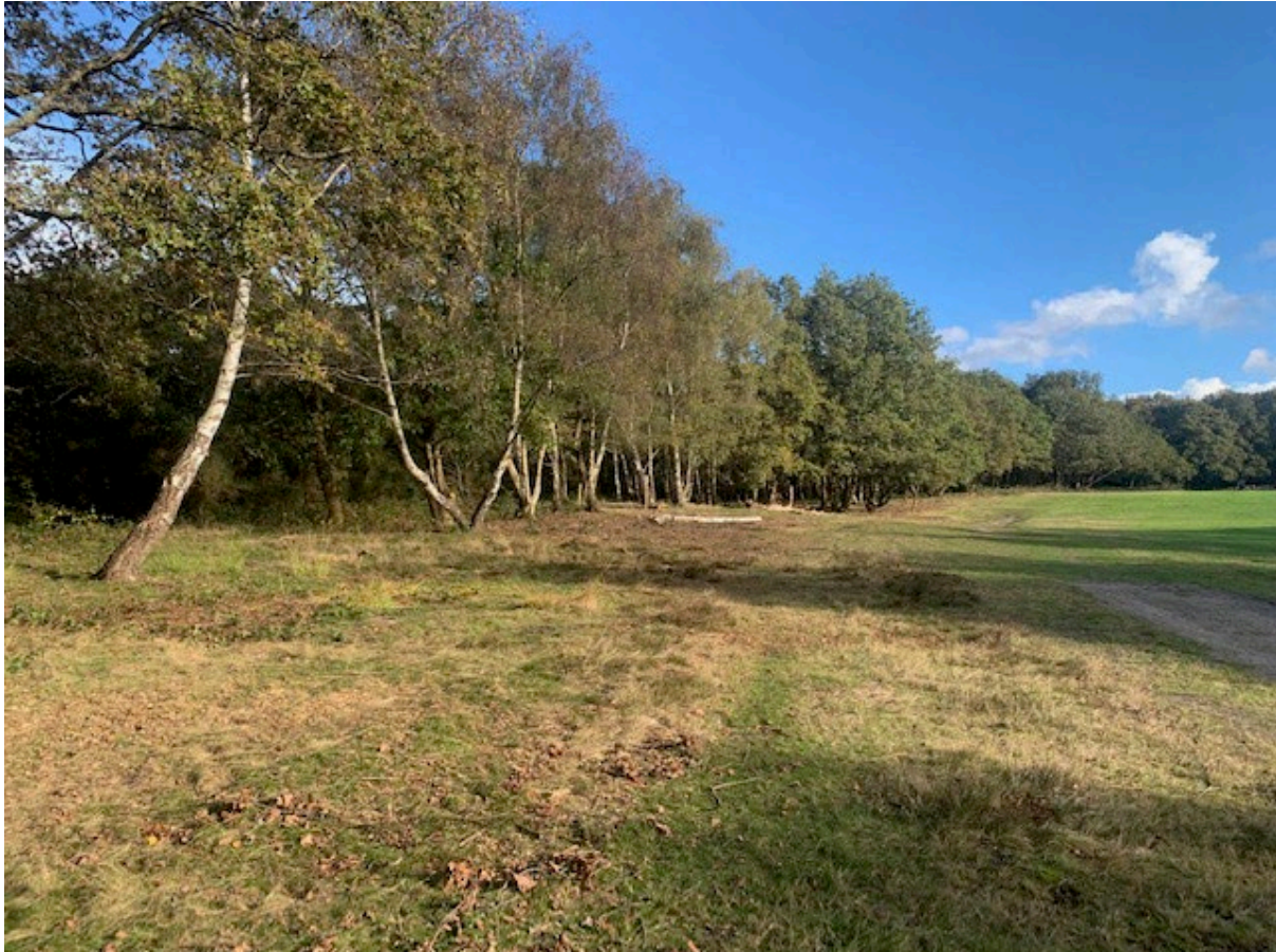
WCGC No 10 Caesar's Well (LSGC 17)

As mentioned in the conservation report for the October 2023 Conservators Board Meeting, during the beginning of October 2023, the WPCCC Maintenance Team began work along the edge of Caesar's Camp fairway. The coppicing of mainly silver birch trees and gorse will help with the recovery of acid grassland in this area. This work was completed during November 2023 and the site will be monitored over the next year. If necessary additional low level thinning work will be carried out.