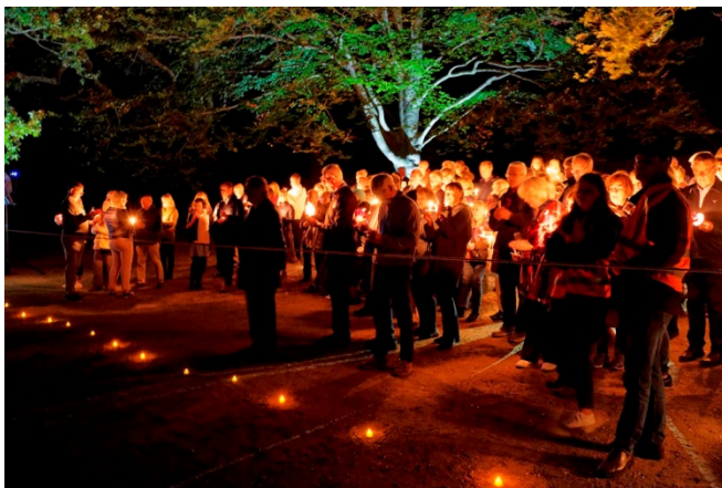
Friends' Launch - Candlelit gathering at Queensmere Pond