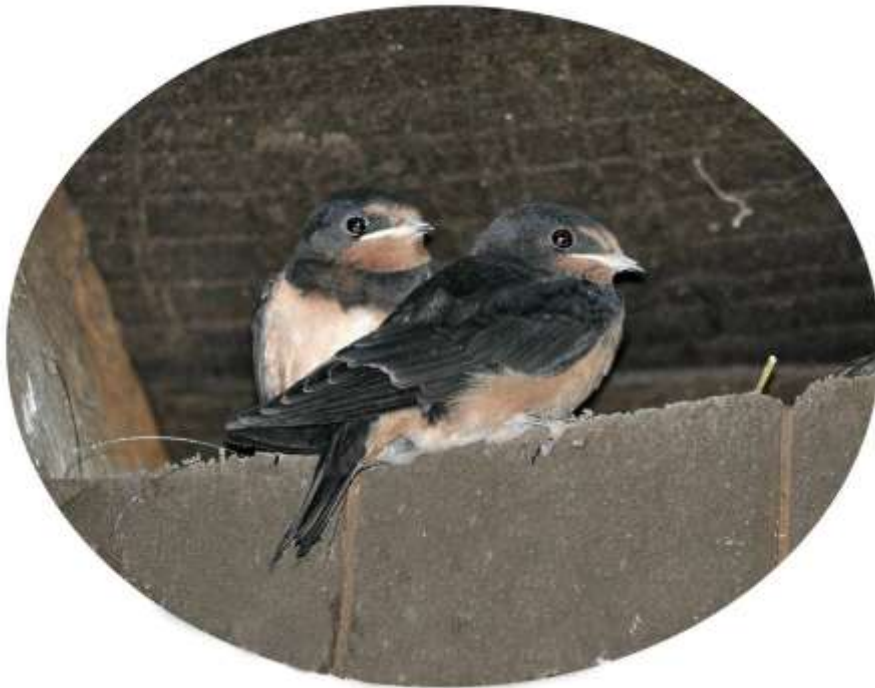
Juvenile Swallows in a stable at the Windmill