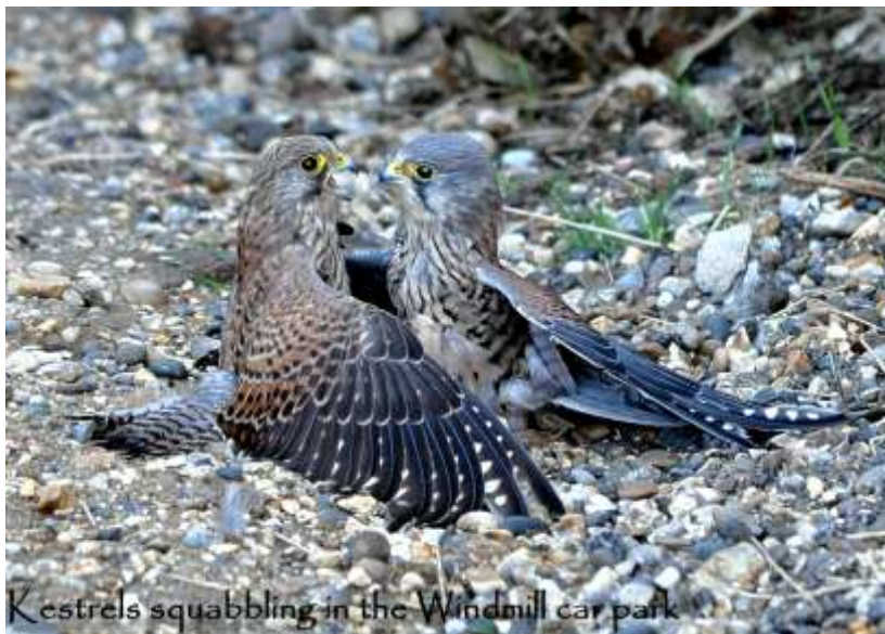
Kestrels squabbling in the Windmill car park

There was no nesting sites discovered this year but three juvenile were active on the Meadow from the 2nd July to the 14 th (DW) and a juvenile was also noted near the North View woods on 3 June (MC). The striking photograph (right) was captured in 2012.