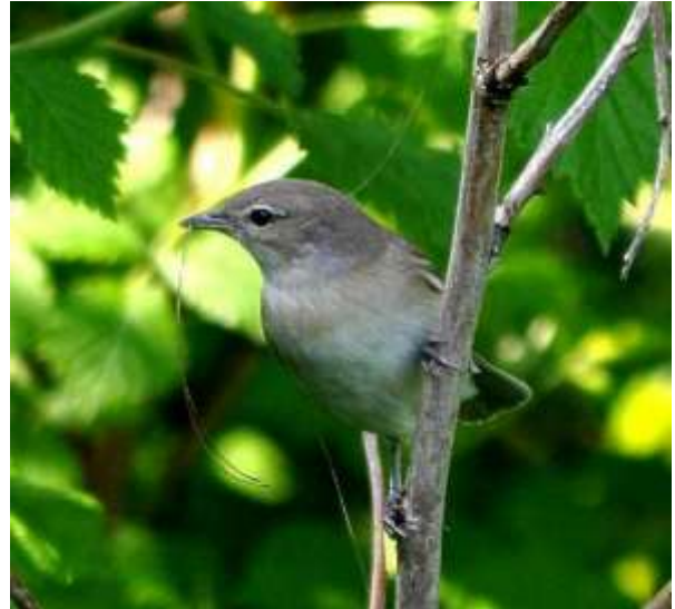
Garden Warbler with nesting material

There was a noticeable shortage of records this year, perhaps indicating a decline in the number of breeding pairs of this thrush on the Common (c20 territories in 2012), but hopefully not. Juveniles were observed ground feeding on the Meadow in late April and early May, but, other than that, the only records received involved small flocks on the western playing fields in August, with a maximum of 12 there on the 19 th (SRS).