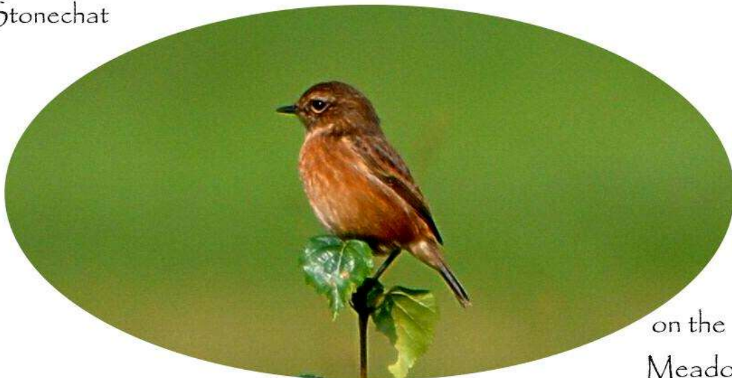
on the Meadow