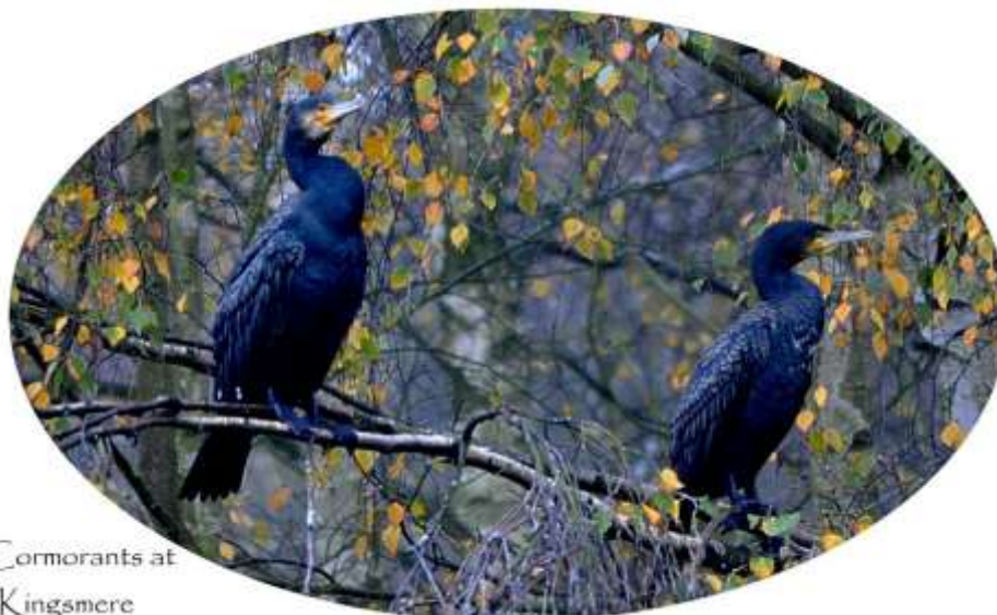
Cormorants at Kingsmere