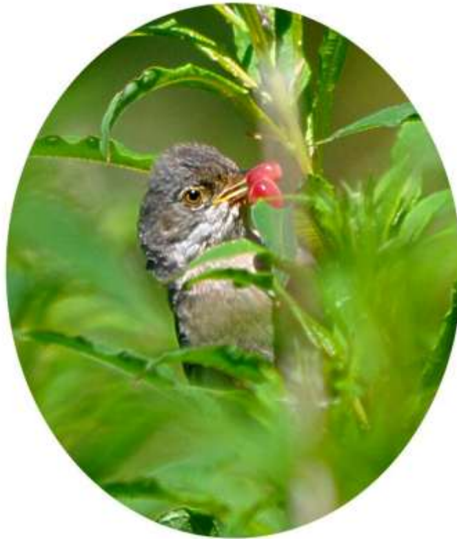
Common Whitethroat with raspberry near the Causeway