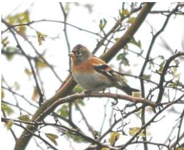
Brambling on the Mounds